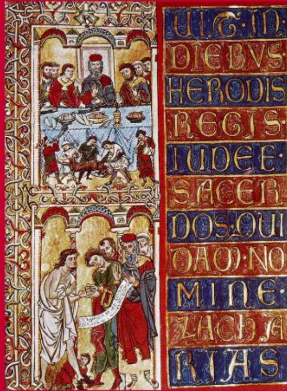
Incipit Page from the Gospel of Luke, depicting images from the Parable of the Prodigal Son. Top left: Illustration of the feast for the Prodigal Son's return, featuring the slaughtering of the fattened calf. Bottom Left: Illustration of the Prodigal Son's return, featuring the gifts of sandals, a cloak, and a ring from his father. Stadtarchiv Goslar, The Goslar Gospels, MS. 2153, Goslar, Germany, ca. 1220-1240.